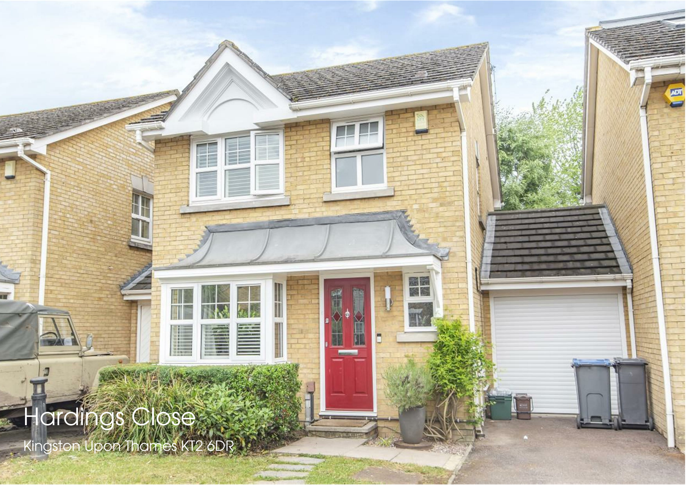
Hardings Close Kingston Upon Thames KT2 6DR

34 Richmond Road Kingston upon Thames Surrey KT2 5ED www.gibsonlane.co.uk Tel: 020 8546 5444